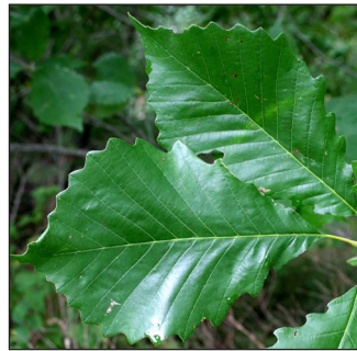
Chinkapin oak leaves