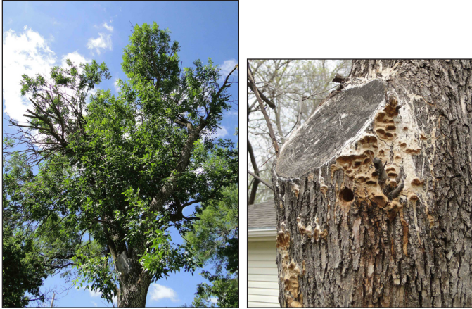
Trees in poor health are generally not suitable for treatment. Left: Extensive dieback; Right: Decay around pruning cut.