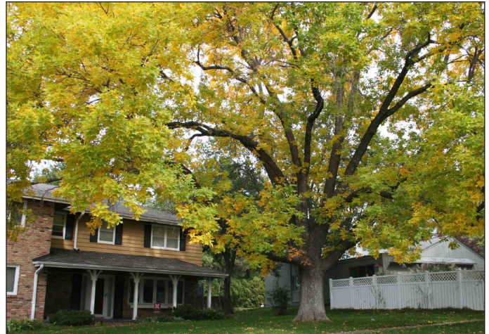
Ash trees provide shade, autumn color, and many other benefits that enhance the value of a home.

The cost of treatments can be considerable. This publication provides guidelines to help you evaluate your tree, discusses options for treatment, and provides information on replacing ash trees with other species.