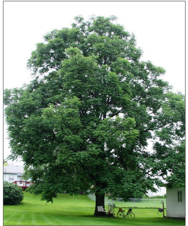
Kentucky coffeetree in Alliance