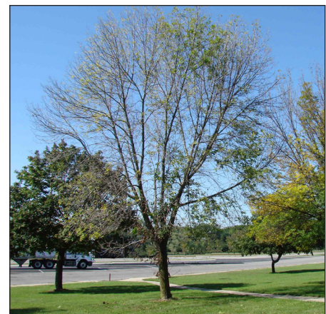
Tree dying from emerald ash borer.