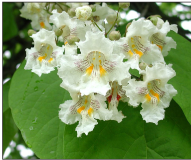
Northern catalpa flowers

Visit your local city park or arboretum to see a variety of trees growing under local conditions.