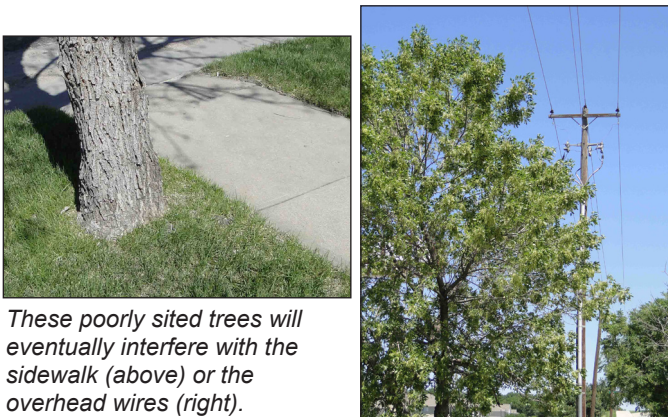
These poorly sited trees will eventually interfere with the sidewalk (above) or the overhead wires (right).